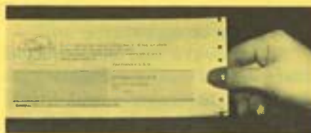
A special G.S.O. form conveys A.A. gratitude on receipt of a group contribution.

Problems? Questions? Let us know. We want to hear from you.